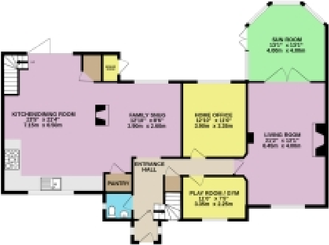
GROUND FLOOR 1693 sq.ft. (157.3 sq.m.) approx.